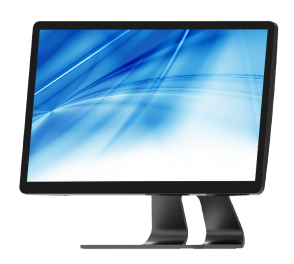
(Stand as pictured is an optional extra)

With a sleek slim design the Android RK3399 Chipset, noise-free Panel PC is capable of multi roles such as Kitchen Video System (KVS), Self-Check In and Self-Check Out, Self Service Terminals (Self Ordering), or act as Digital Signage Display / Information Display.