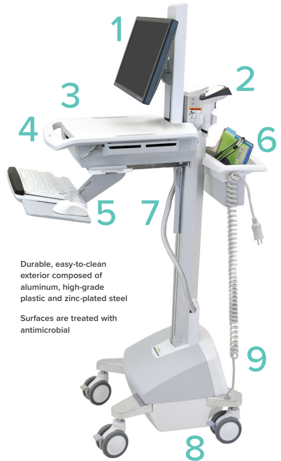
SV42 LiFe-powered LCD Pivot cart

Durable, easy-to-clean exterior composed of aluminum, high-grade plastic and zinc-plated steel