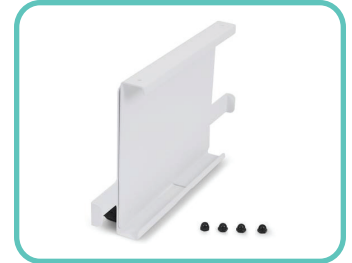
SV10 TABLET CONVERSION KIT, EASEL 98-003