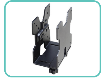
MINI PC MOUNT 80-107-200