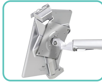
LOCKABLE TABLET MOUNT 45-460-026

LiFeKinnex™ Battery Brackets and Cable Box Coming soon: Optional accessory works with a LiFeKinnex Battery and Smart Battery Dock (sold separately) for reliable, hot swap power.