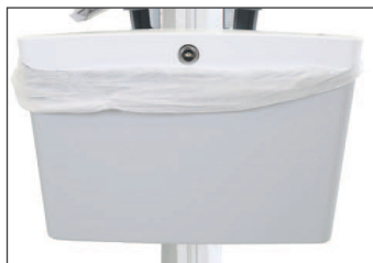
SV Storage Bin