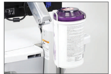
T-Slot Wipes Holder