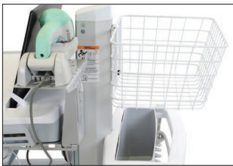
SV Wire Basket, Small