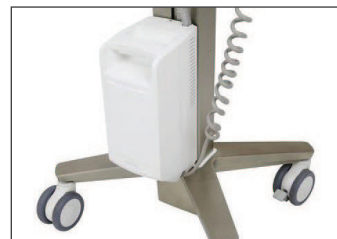
LiFeKinnex™ Power System