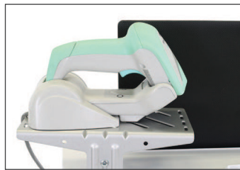
SV Scanner Shelf