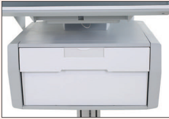
SV Primary Storage Drawer, Single Tall