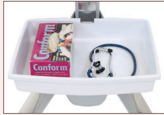
SV Front Tray