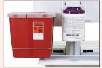
Sharps Container T-Slot Bracket Kit