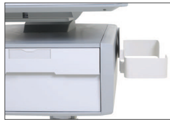
SV Sharps Container Drawer-Mount Bracket Kit