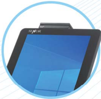
MSR Card Reader*