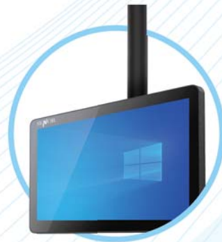
VESA Mount Compatible